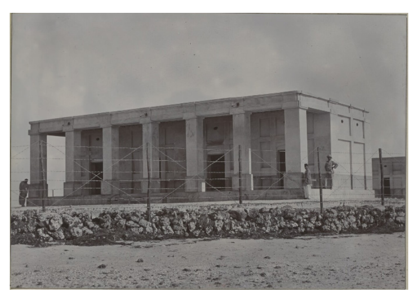
Figure 1. 1931 Photograph of the new quarantine site in Bahrain. IOR/R/15/2/306, f 115 1, "Photograph of the new quarantine site, Bahrain"

In the accompanying photograph (Figure 1), the quarantine station sits on slightly elevated ground and is cordoned off from the surrounding community by a barbed wire fence. This arrangement partitioned individuals with the potential to carry disease in buildings that differed from indigenous architecture by appearance, material, and organization. It also managed water use and the separation of waste in the form of designated wells and latrines.