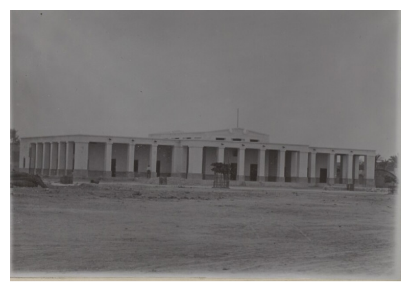
Figure 2. 1931 Photograph of Jaffariah School, Bahrain. IOR/R/15/2/306, f 45, "Photograph of Jaffariah School, Bahrain"

necessary would be used to hold another hundred boys."<sup>48</sup> The building also held accommodations for the schoolmasters, and was "built of local Murraba stone, plastered with Juss<sup>49</sup> and whitewashed."<sup>50</sup> Except for iron girders, cement, and imported wood, the school used local materials. The school, envisioned to condition local students into a modern and disciplined lifestyle, was open to its surroundings, while the quarantine station was fenced off. The pillars and sprawling, airy design of both structures emphasize permanence and a visual and functional rupture from indigenous architecture.